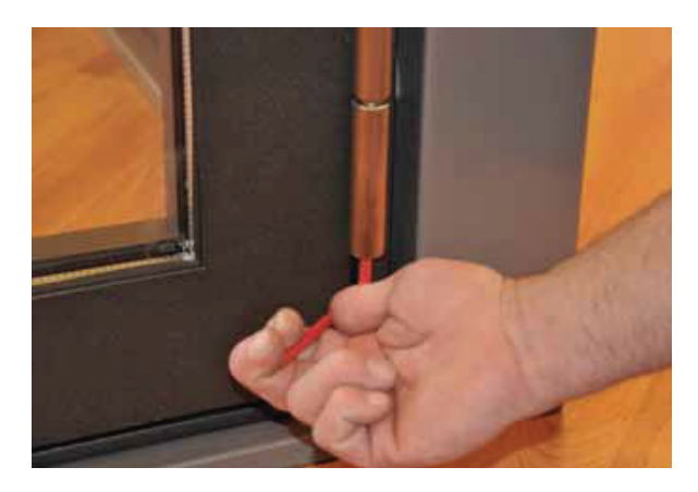
To adjust in height loosen the lock nut with a 6mm Allen key.