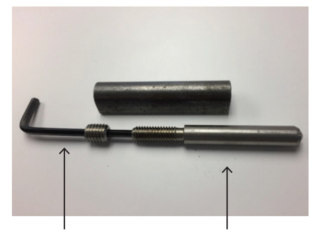
5mm Allen key shown inserted through hollow locking grub screw