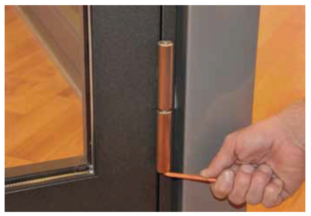
Drive a 5mm Allen key through the hollow lock nut and move door leaf up or down by turning the hinge bolt with the key. After adjusting the height fix bolt with the lock nut.